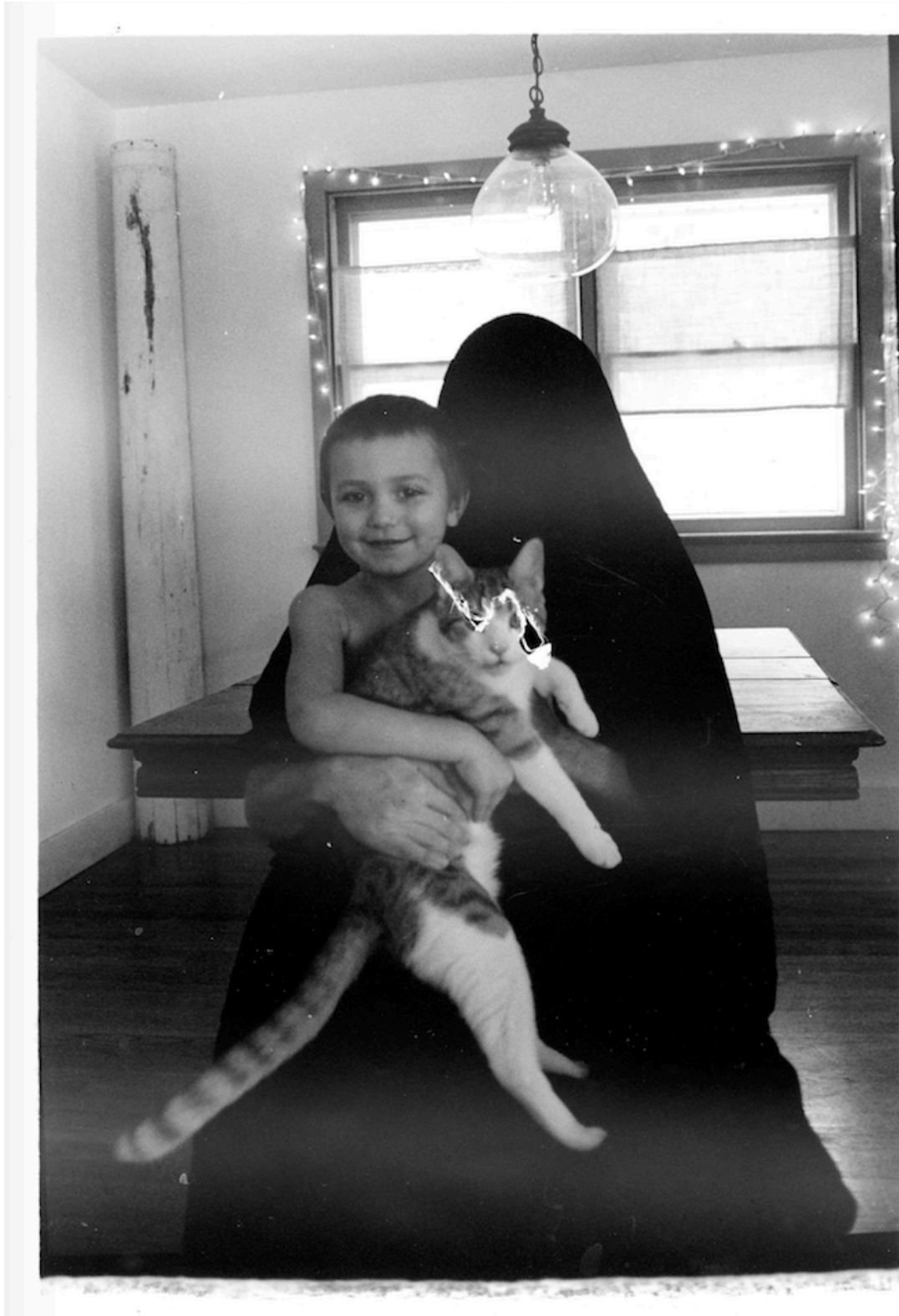
Tim Roda Hidden Father 4 silver gelatin 15 x 10.5 inch