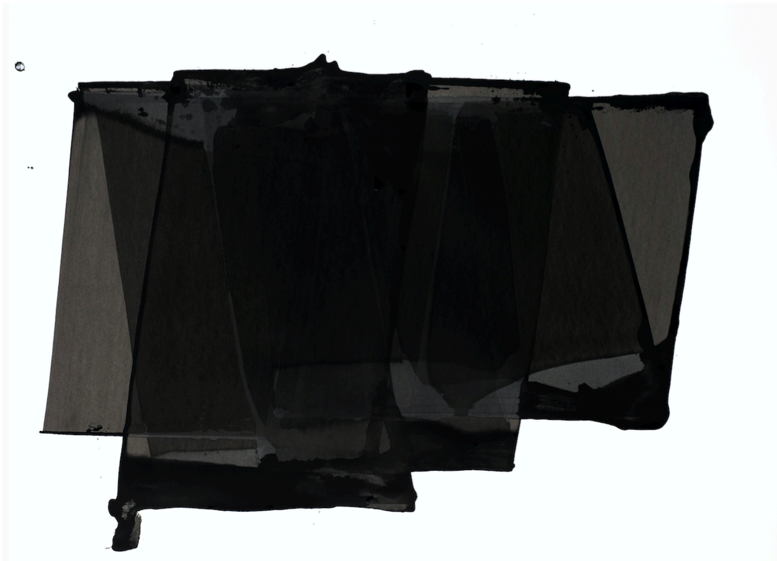
Markus F. Strieder Faltungen schwarz 2014 ink on paper 72 x 101 cm