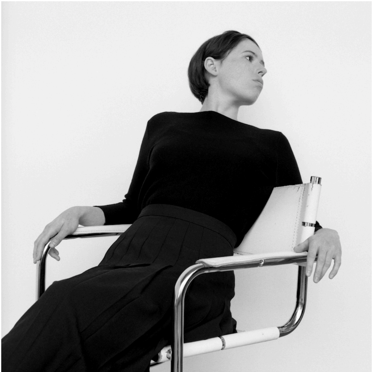
Ann-Kathrin Müller Die Observation 2 2015 silver gelatin on aludibond 110 x 110 cm